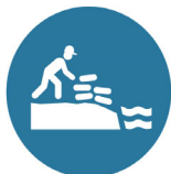
Emergency Response and Preparedness