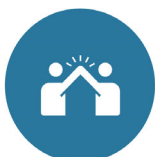
Support Regional Partnerships

Your annual assessments provide flood management for over 8,500 acres and 1,800 landowners in the Columbia Corridor.